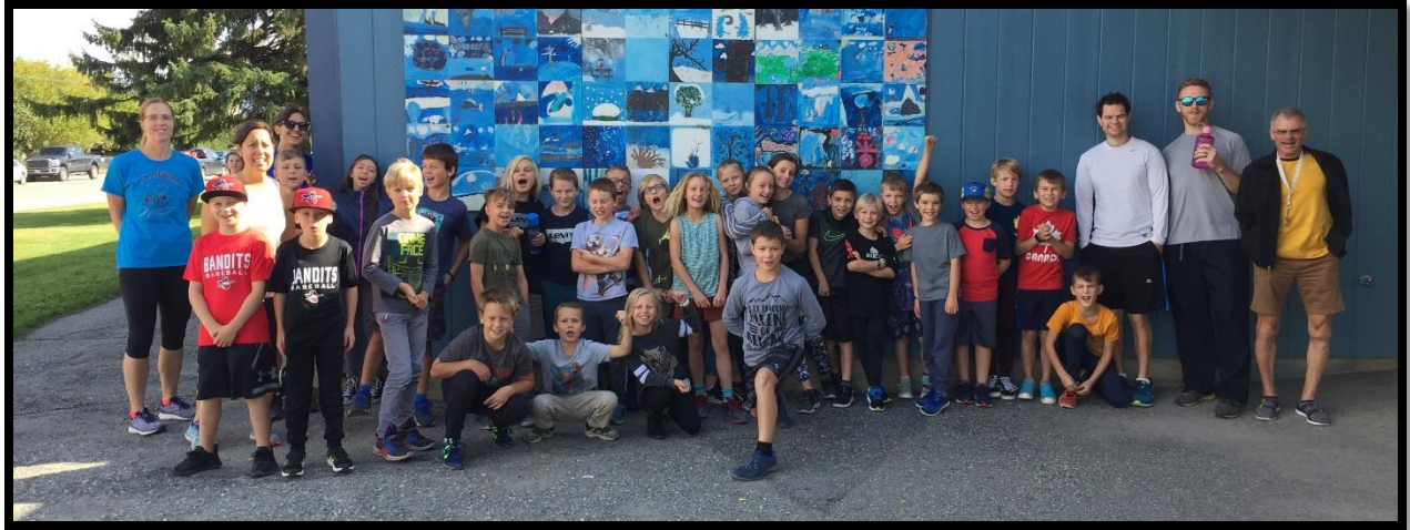
The weather was perfect for our first Friday School Wide Run. Pictured here are the students who ran the 3 km "Big Loop". Congratulations, keep it up!